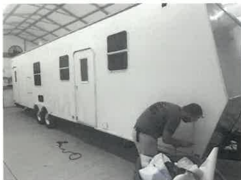
CCFCA Fire Safety House with wrap removed.