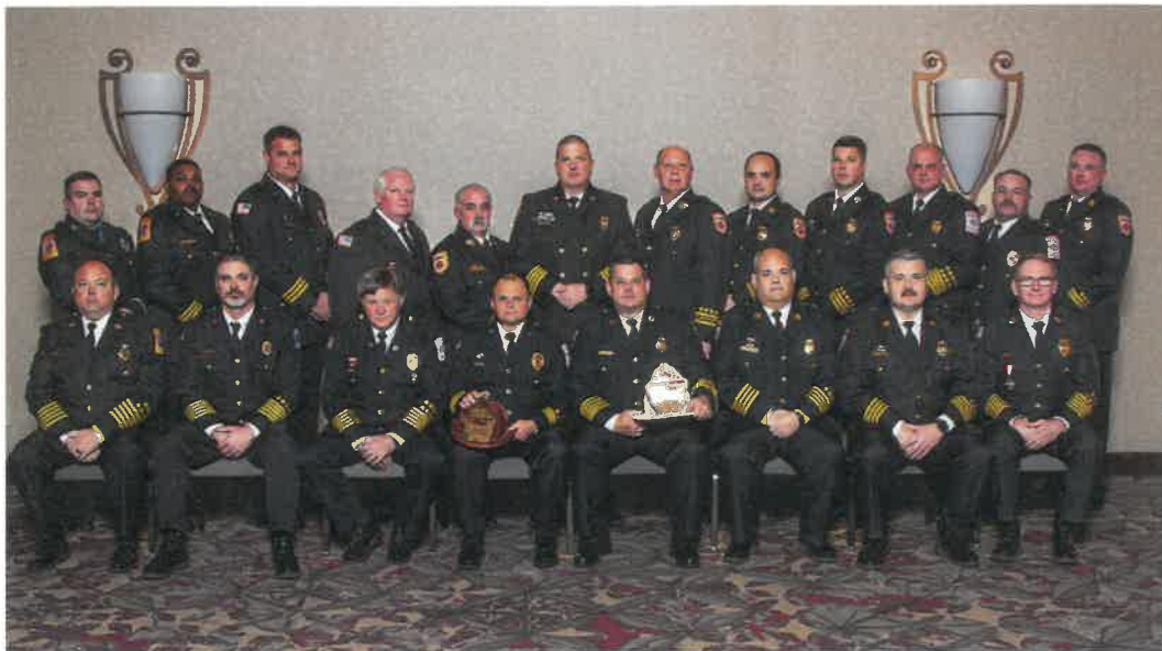
Cumberland County NCAFC- MWC Awards Banquet Delegation